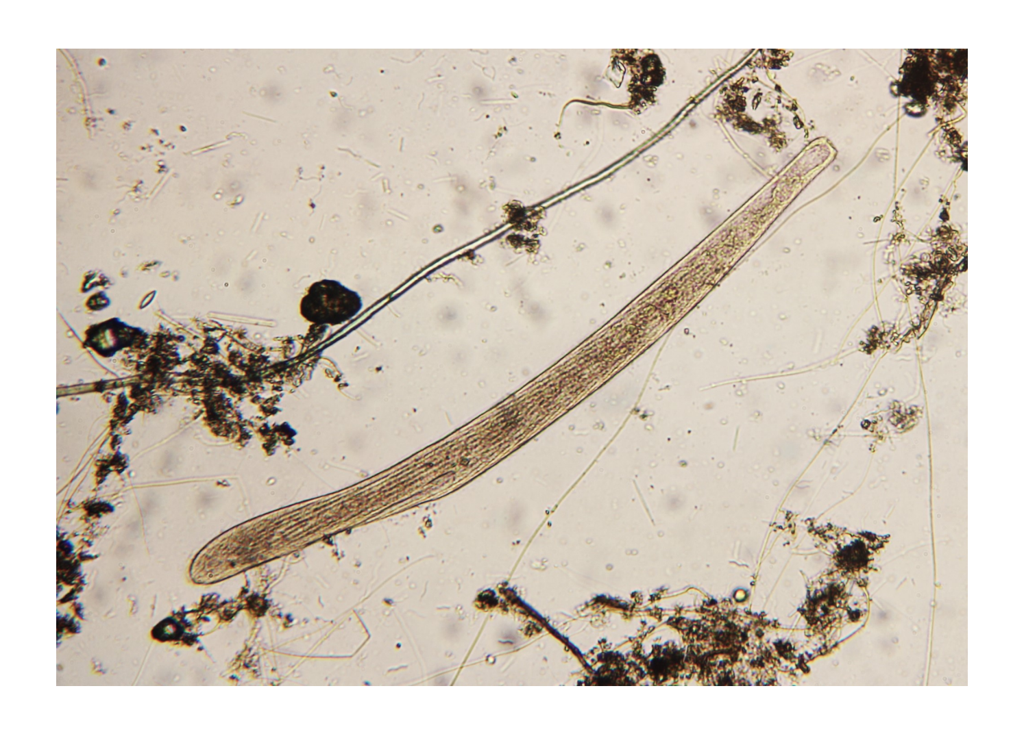
Published in the November 2024 issue of Micscape magazine.